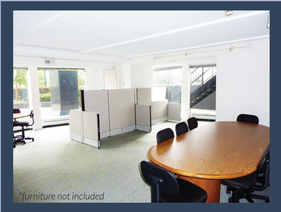
*furniture not included