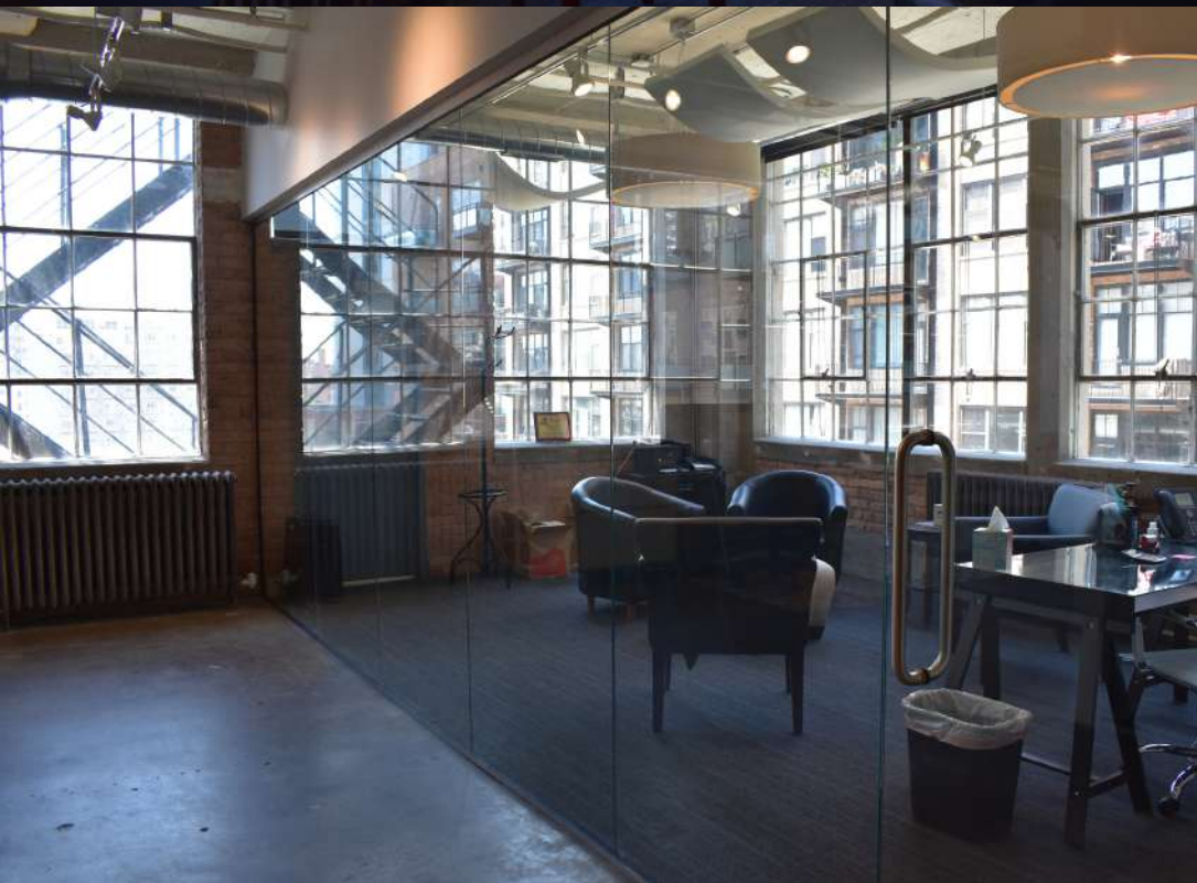
Original restored brick and concrete loft with a massive window line to let natural light spill in on two sides