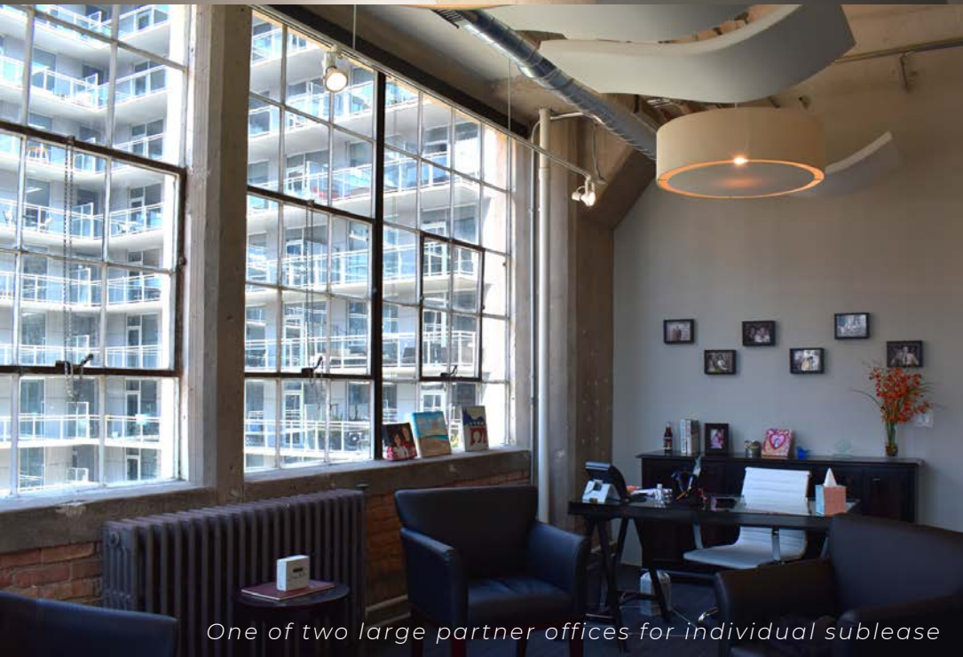
One of two large partner offices for individual sublease