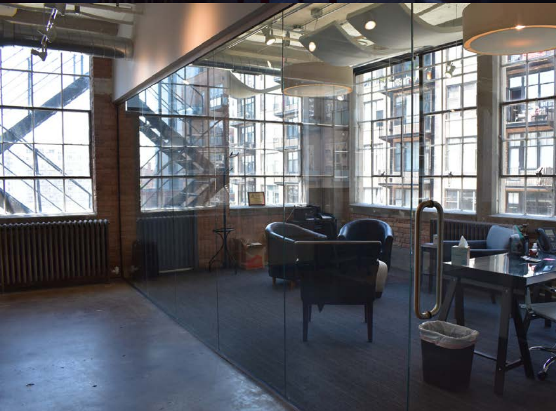
Original restored brick and concrete loft with a massive window line to let natural light spill in on two sides