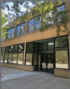
2113 S State