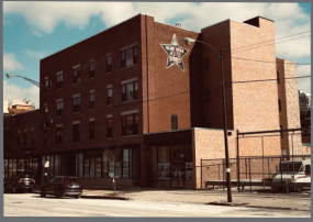
2001 S State