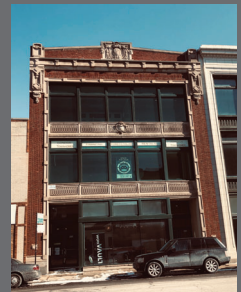
2325 S Michigan