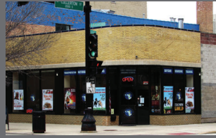
2000 S Wabash