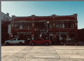
2210 S Michigan