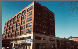
2036 S Michigan