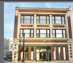
2245 S Michigan