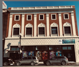
2229 S Michigan