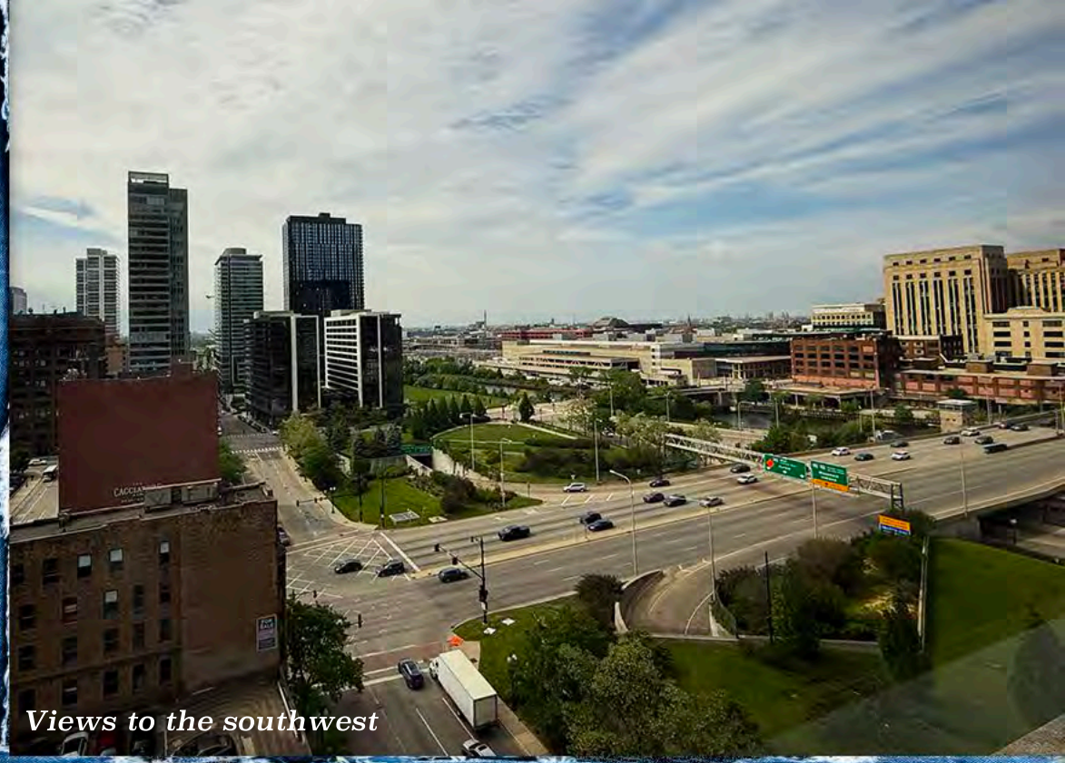
Views to the southwest